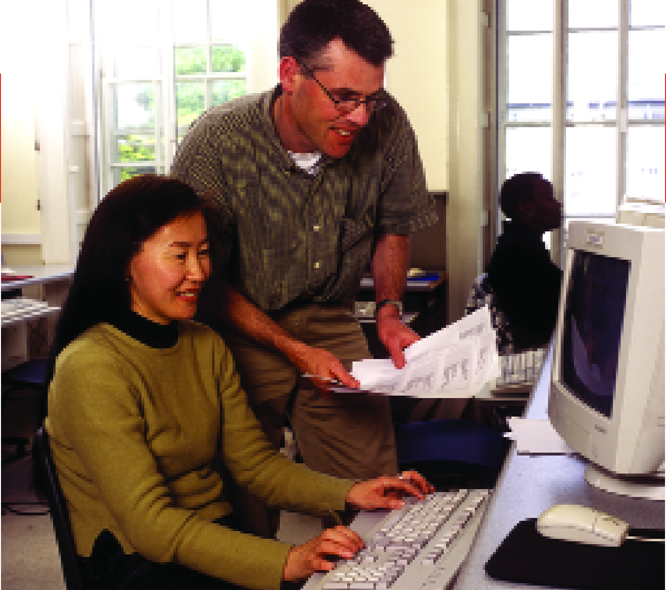
Examples of modes of study towards an MA in Development Studies award